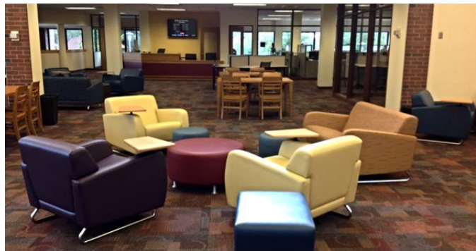
Picture of Reeves Memorial Library, Seton Hill University

The print collection was moved to compact shelving on the street-level first floor, where students can also find two silent study rooms with both comfortable furniture and outlet-equipped workspaces. Upstairs, in addition to staff offices, group study rooms feature whiteboards and Apple TVs. Two high-tech classrooms accommodate information literacy classes, study halls, and meetings. The large common area offers printing, armchairs, tables, and outlet-equipped study carrels. The study rooms and classrooms are available on a first-come, first-served basis if not reserved in advance via an online booking system and have experienced heavy usage since the opening of the Learning Commons in August. The changes and opportunities for increased collaboration and easier access to educational technology have been well-received by students and faculty and are in high demand.