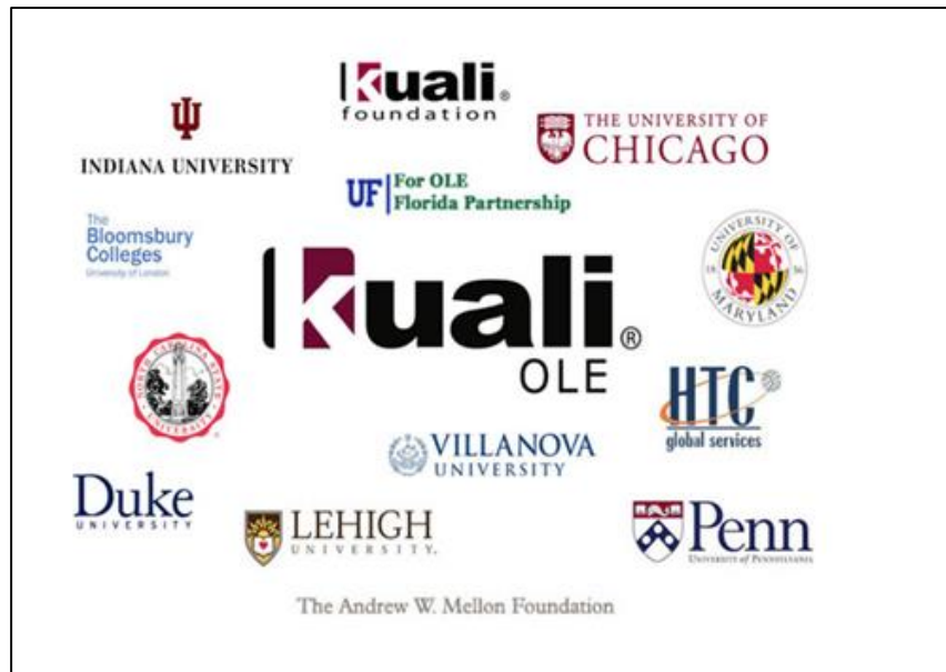
Kuali OLE partners

This open system allows library data to be shared with other campus systems, such as financial systems. The Kuali OLE project is a Mellon Foundation-funded, community-sourced project developed by the Kuali Foundation with the OLE university partners noted below.