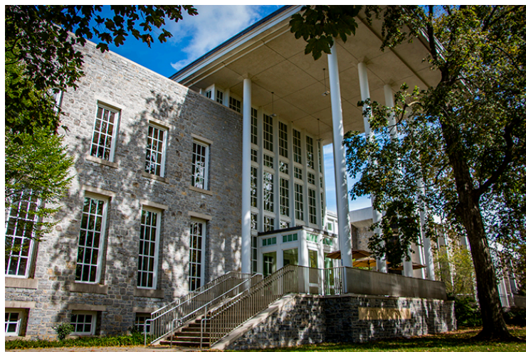
Waidner-Spahr Library

Carlisle, PA—Dickinson College's Waidner-Spahr Library earned the inaugural First Year Experience (FYE) Innovation Award for its “strong collaborative efforts, established assessment practices and proven record at improving learning outcomes.” Granted by Case Western Reserve University and CREDO, an international library information-skills solutions provider, the award includes a $1,500 cash prize and a commemorative plaque presented at the 2018 Personal Librarian & FYE Library Conference in Cleveland, Ohio, in March.