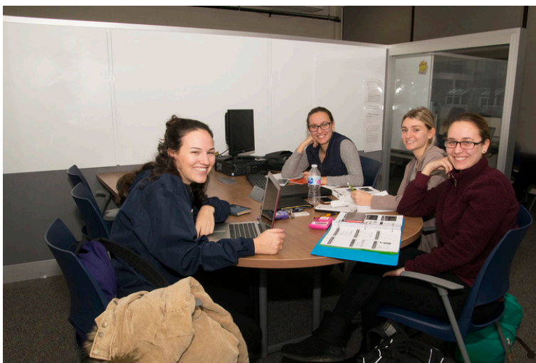
Pods feature writable walls and plenty of ports and privacy for Abington students to successfully collaborate.