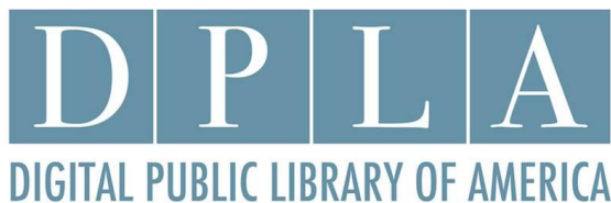
DPLA logo

Boston, MA – The Digital Public Library of America (DPLA) recently launched an outreach program centered on Community Reps—volunteers who engage their local communities by leading DPLA outreach activities, such as workshops, presentations, Wikipedia editathons , hackathons , or even working with educators to develop class projects or assignments involving DPLA research. In January 2014, DPLA welcomed its first class of 100 Community Reps, hailing from 36 states and three countries. Among them are four Pennsylvania-based librarians: