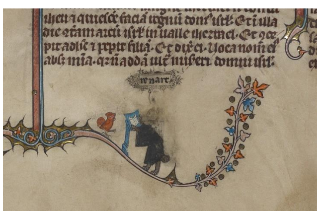
Detail from a marginal illustration in a Bible showing a defaced fox preaching to a rooster. Arras, France, late 13<sup>th</sup> century.

Reactions take many forms. They include the manipulation of physical objects through the marking up of texts, addition of illustrations, the disbinding of books or rebinding fragments, as well as the manipulation of digital objects, thanks to new technologies, ink and parchment analysis, virtual reconstruction, among many other processes. Both the exhas reacted to manuscripts over time as witnessed by the