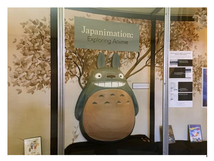
A 3-D representation of Totoro anchors the Pattee Library central entrance display cases for the "Japanimation: Exploring Anime" exhibit, which is open through December 16

One of the library's related titles on exhibit, "The Roots of Japanese Anime Until the End of WWII," offers scholarly analysis of eight early Japanese sound anime from the 1930s and early '40s. Other titles on exhibit, also available for borrowing, include encyclopedias, scholarly