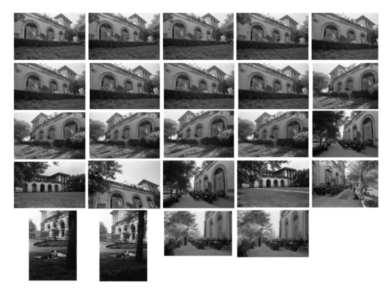
A montage of the resulting photographs from a search for the College of Fine Arts building. Similarity search proved particularly effective at clustering buildings together—all these shots show different views of the College of Fine Arts, with many of the images coming from different parts of the collection outside the original job.

Pittsburgh, PA -- An internal web application built by Carnegie Mellon University (CMU) Libraries faculty and staff leverages computer vision to improve the discoverability of archival photos. Here, archivists can quickly find groups of images depicting similar subjects and add descriptive metadata tags in bulk. This approach combines the best of both worlds: utilizing the existing structure of the photo collection to make tagging efficient and context-sensitive, while also applying visual search component, allowing users to nimbly navigate across folders and boxes of the collection and identify potential photos for tagging that might have otherwise been missed.