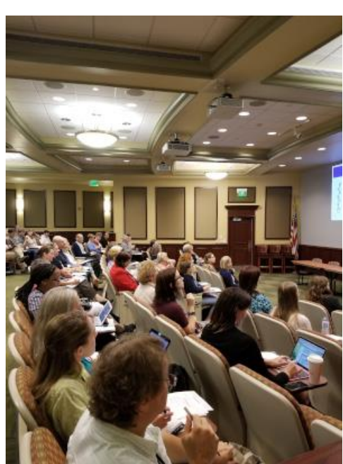
Affordable Learning PA OER Summit

University Park, PA—PALCI staff, along with the steering committee of the Affordable Learning PA (ALPa) project and Penn State University, hosted the first Open Educational Resources (OER) Summit earlier this month. The theme of the event was "Building Community," and more than 100 attended from across the state and beyond. The Summit allowed librarians, faculty, and others to collaborate on building a network dedicated to making higher education more accessible and affordable.