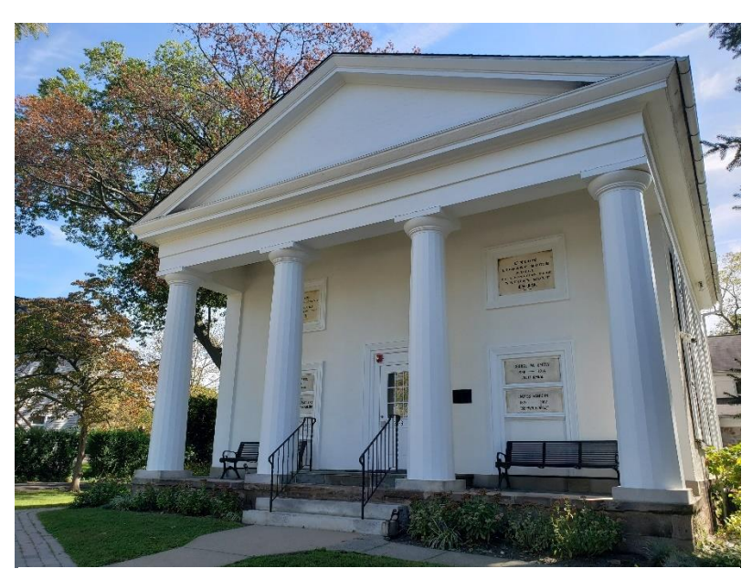
Union Library of Hatboro.

The library's 2019 funding was about .21 mills; this will increase to .55 mills beginning in 2020. The library's local funding had previously been entirely through discretionary means. Thus, as well as an increase in the funding level, the referendum increased the stability of the library's future. The third oldest library in the